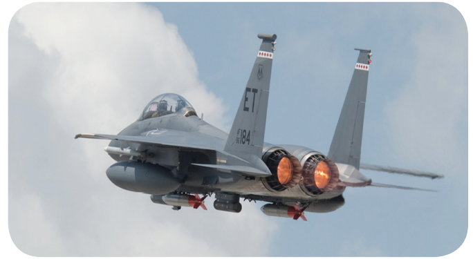
An F-15E conducts a vibration fly-around test.